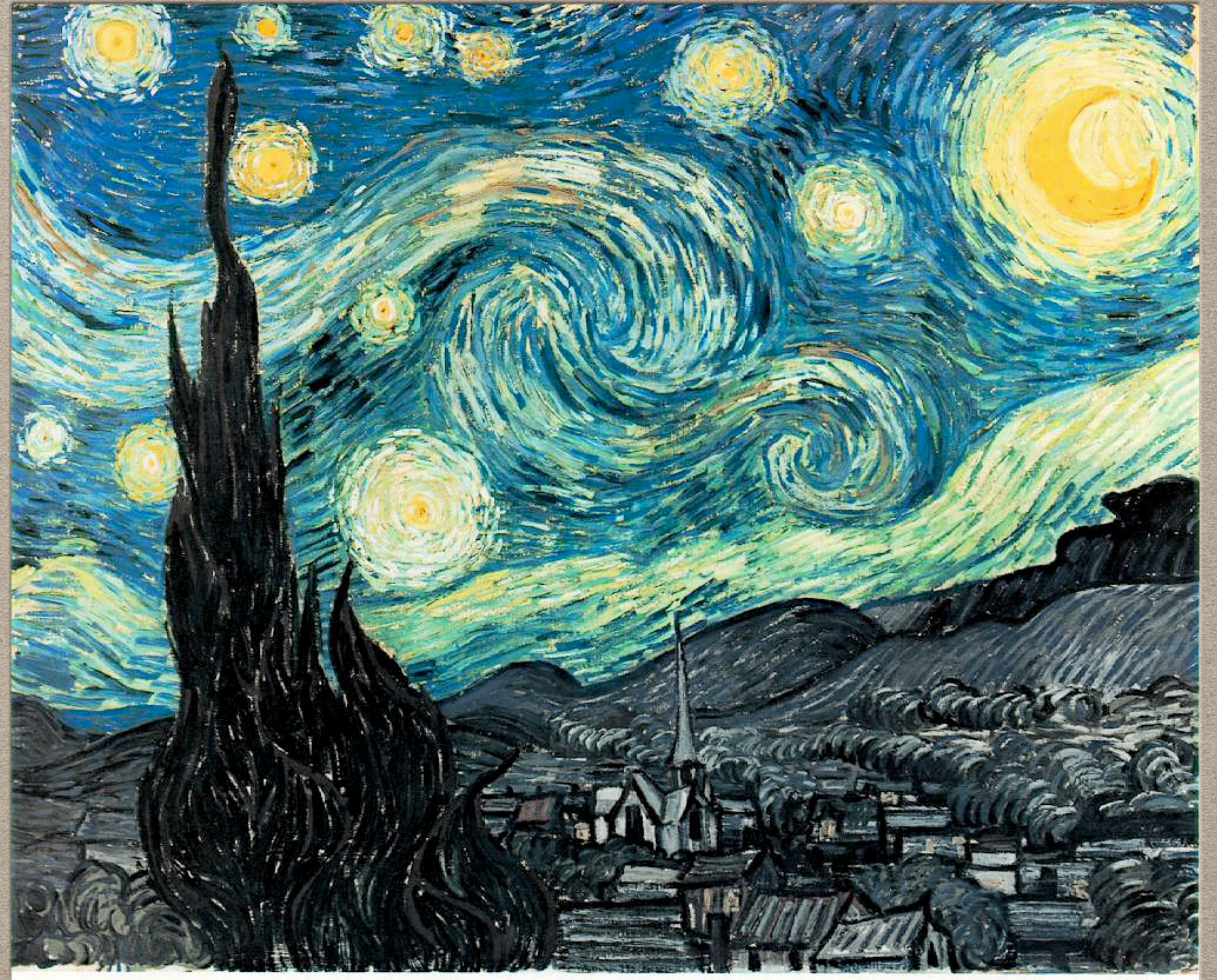
Vincent Van Gogh The Starry Night Oil on Canvas 1889 (29 in × 36 1/4 in)