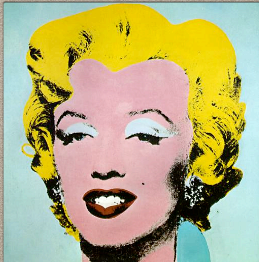
Andy Warhol. Marilyn. 1964. Silkscreen and oil on canvas. 40"x 40".