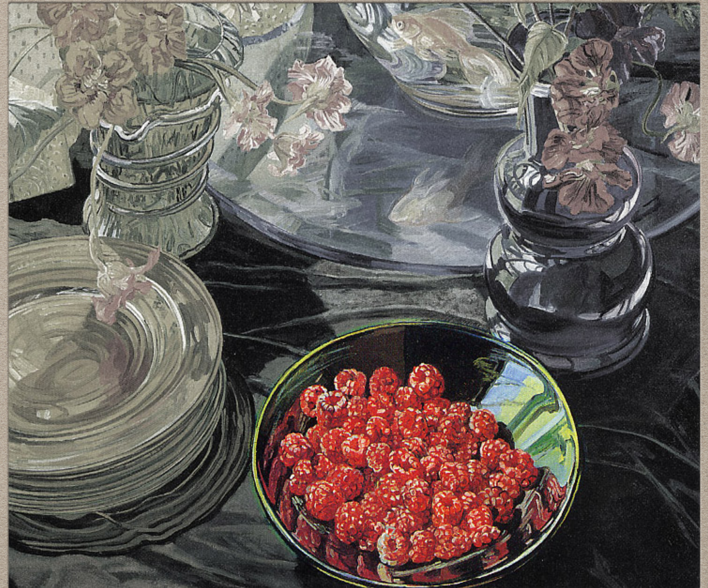
Janet Fish Raspberries and Goldfish 1981 Oil on Canvas 72 x 64 in.

For example, when you look at this part of the painting you see a shiny, round bowl outlines with a thin yellow line filled with bumpy, red raspberries.