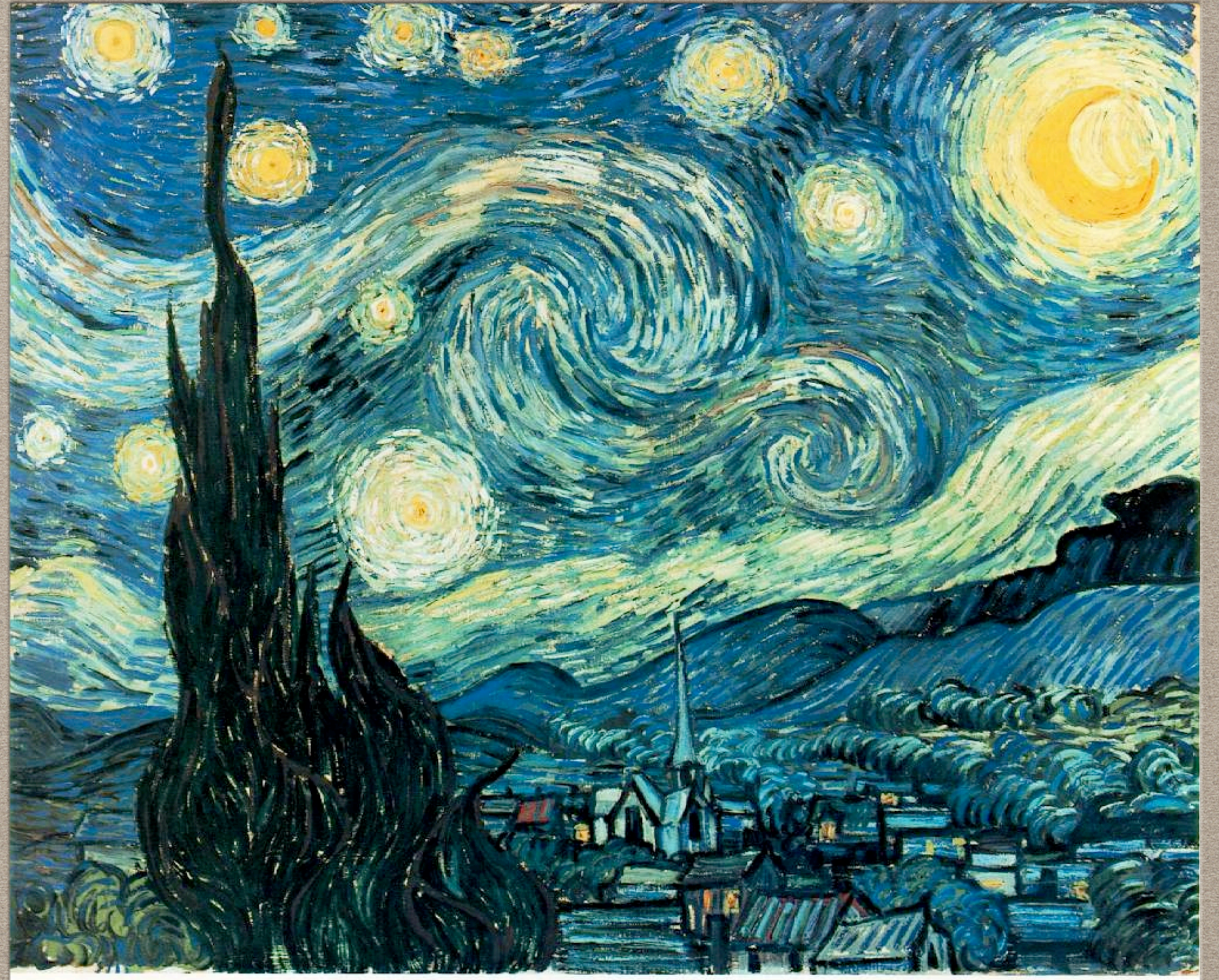
Vincent Van Gogh The Starry Night Oil on Canvas 1889 (29 in × 36 1/4 in)