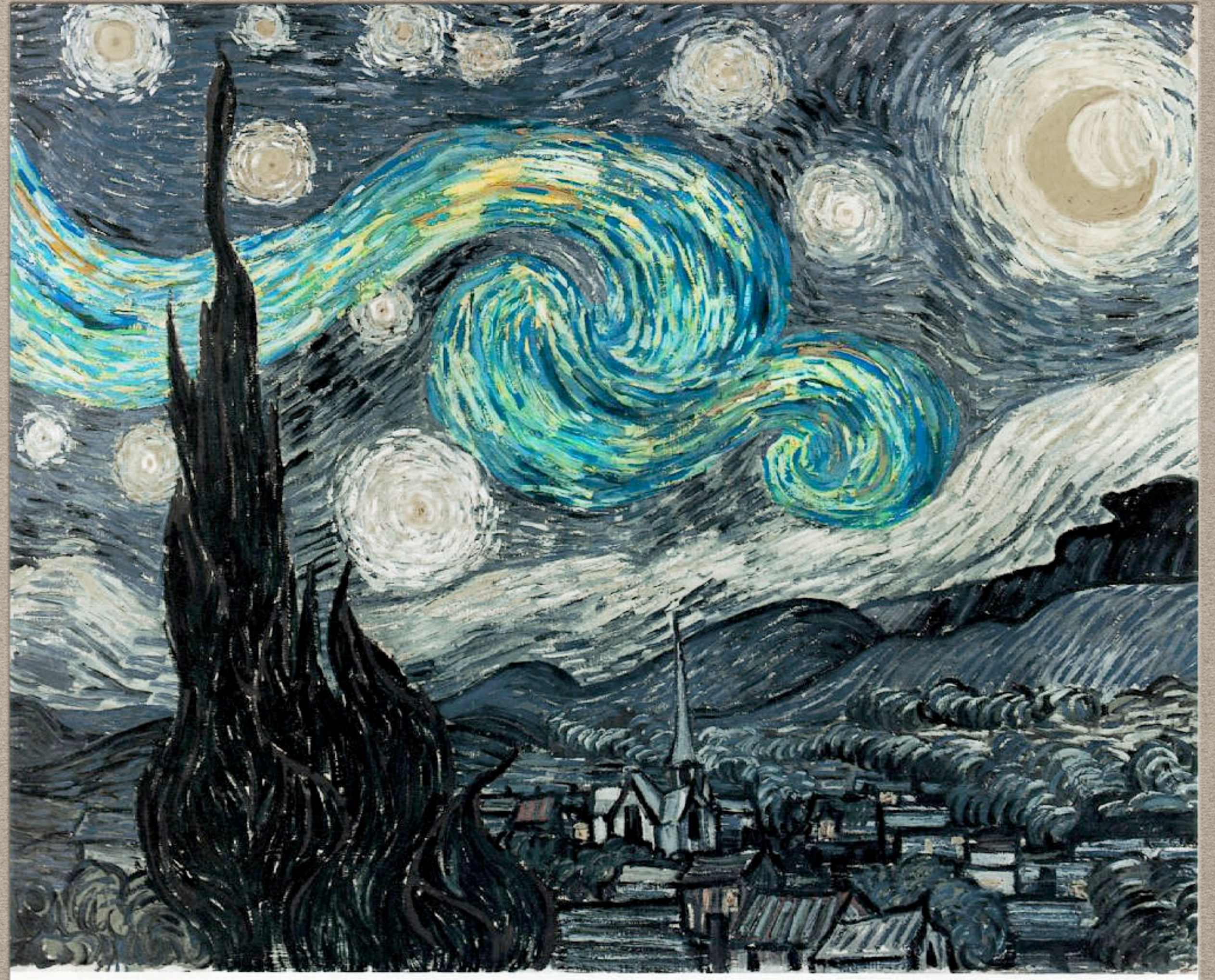
Vincent Van Gogh The Starry Night Oil on Canvas 1889 (29 in × 36 1/4 in)