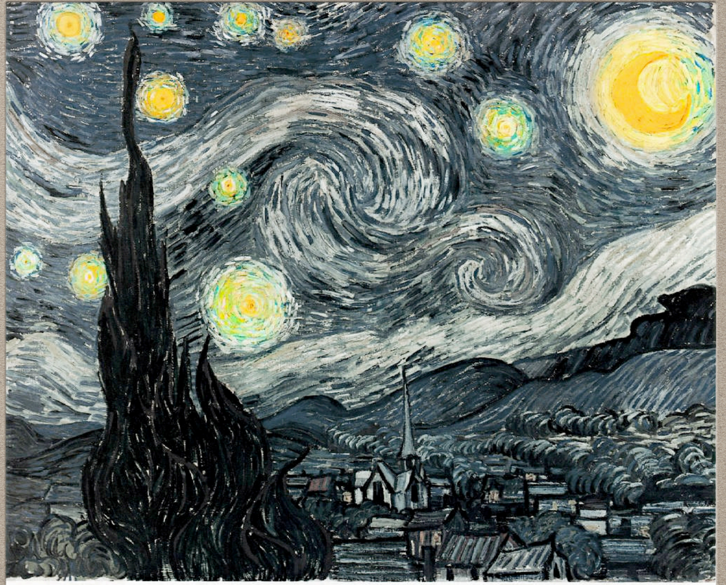
Vincent Van Gogh The Starry Night Oil on Canvas 1889 (29 in × 36 1/4 in)