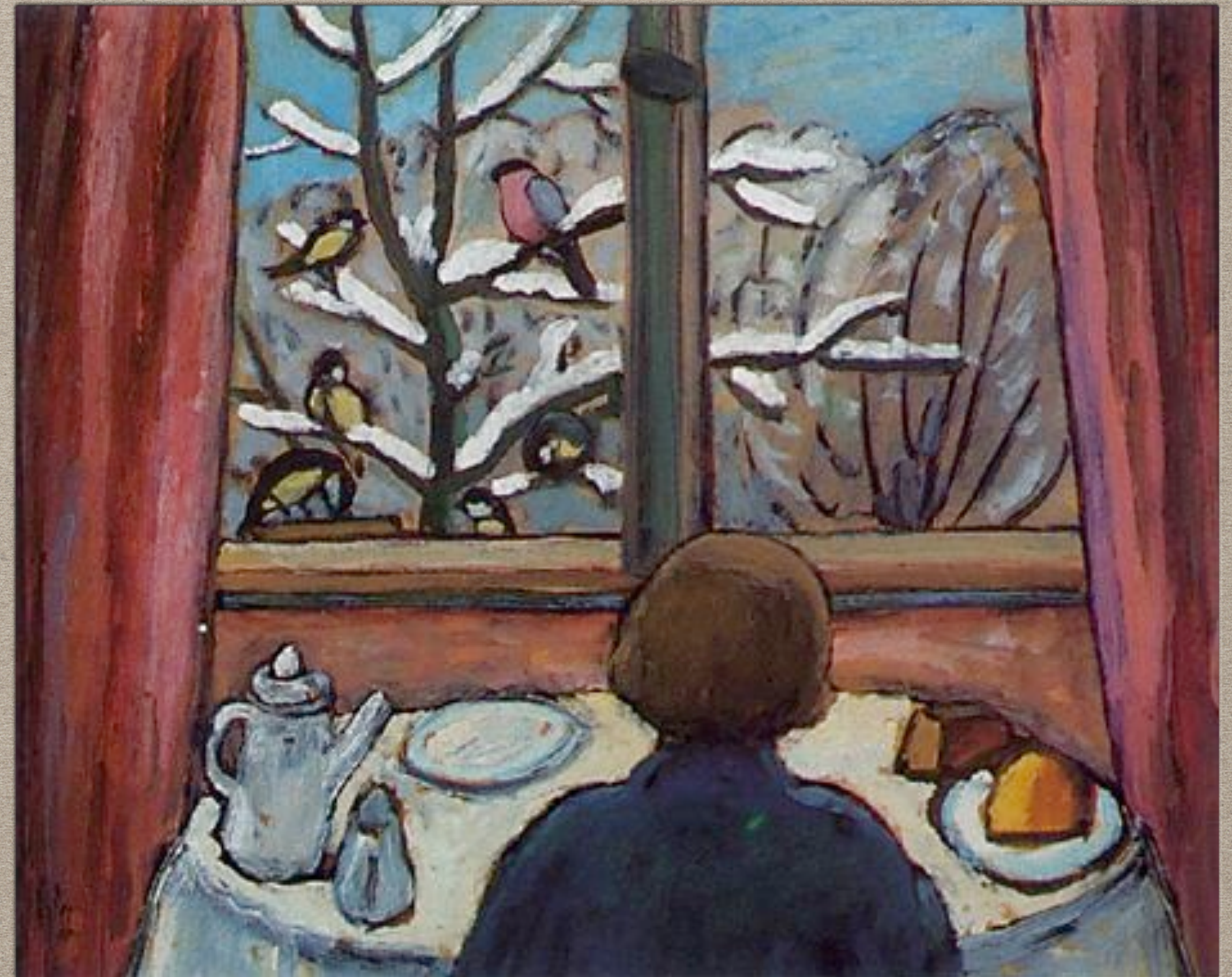
Gabriele Munter Breakfast of the Birds 1934 oil on board National Museum of Women in the Arts